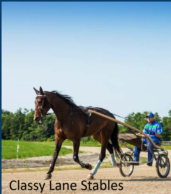
Classy Lane Stables